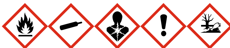
Flame Gas cylinder Health hazard Exclamation mark Environment